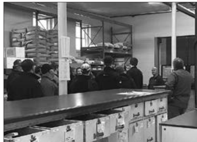
Touring the Vita Plus manufacturing plant in Madison.