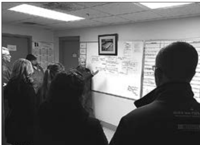
A lesson about the Vita Plus Corporation Madison distribution system.