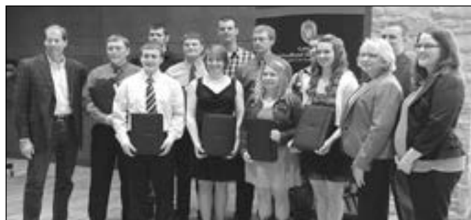
At the March commencement ceremony, several FISC students were recognized by WALSAA for their achievements.

Our on-campus advisory group, the FISC Planning Council met several times throughout the 2013-14 FISC year and made decisions on the FISC calendar, incorporated additional admissions practices and began discussing offerings in the program. These discussions