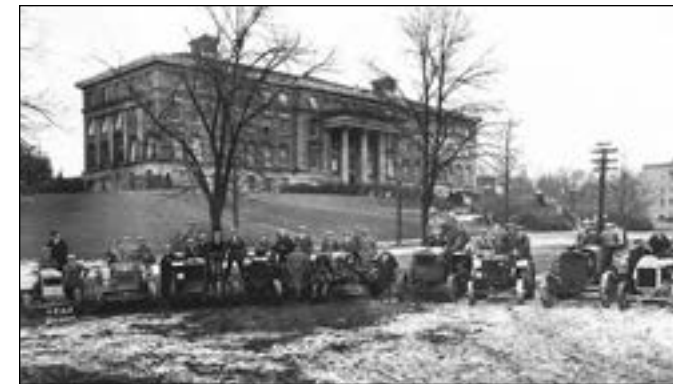
Posing with a variety of tractors, mid-to-late 1920s.