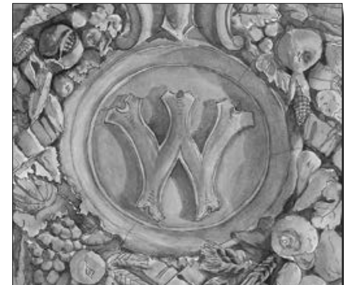
Watercolor of a building detail from Ag Hall.