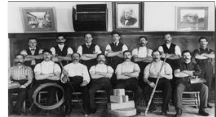
Cheesemakers taking part in a short course, ca. 1900.

Photo courtesy of UW-Madison Archives Image S05559