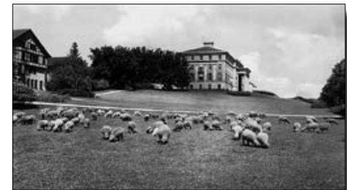
Campus sheep grazing peacefully, ca. 1910.

Photo courtesy of UW-Madison Archives Image S05559