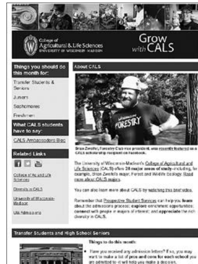
CALS student recruitment email

lab equipment and other items found on the CALS campus. These photos were later used to spell messages in a variety of ways. You may even have an "ABCs of CALS" poster from the 2013 WALSAA Football Fire-Up!