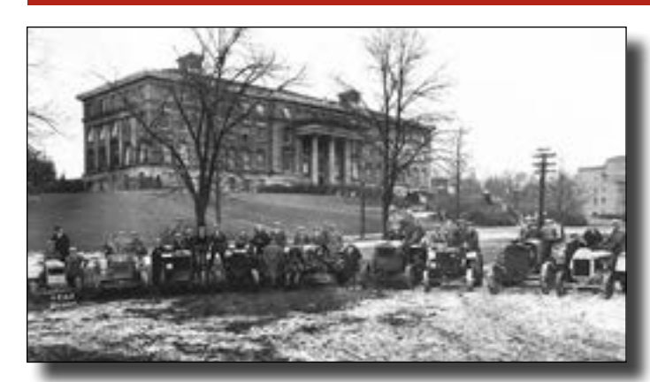
Posing with a variety of tractors, mid-to-late 1920s.