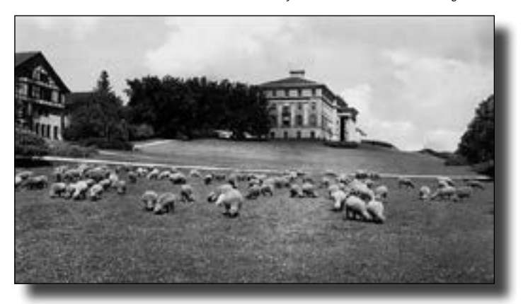
Campus sheep grazing peacefully, ca. 1910.

Photo courtesy of UW-Madison Archives Image S05559