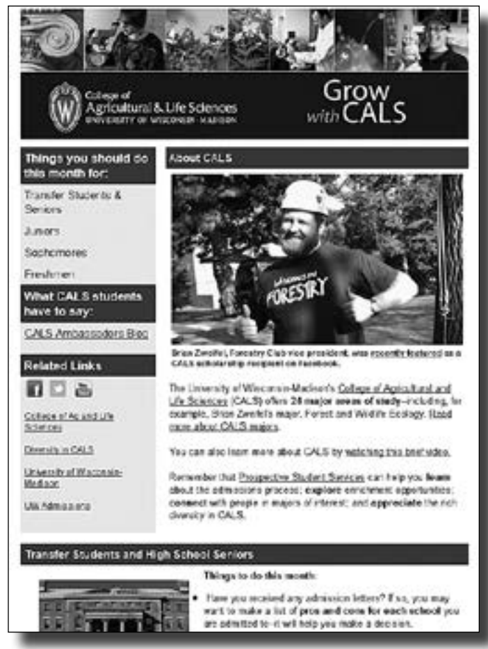
CALS student recruitment email

We are proud that CALS External Relations received three NAADA awards this year. The CALS photo alphabet project sought to complete the alphabet – from A to Z – in photos taken of plants, architectural elements, naada.org.