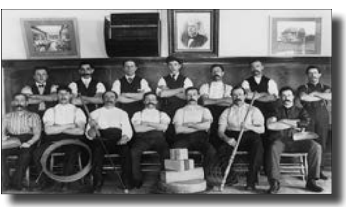
Cheesemakers taking part in a short course, ca. 1900.