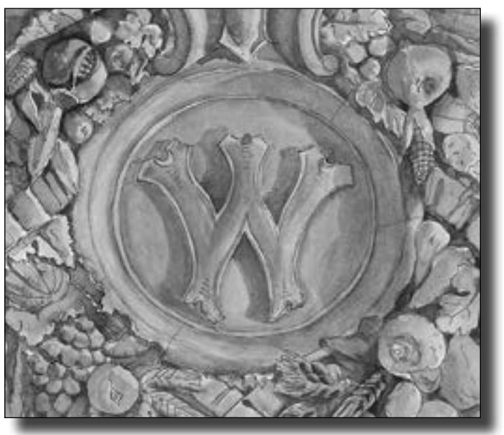
Watercolor of a building detail from Ag Hall.