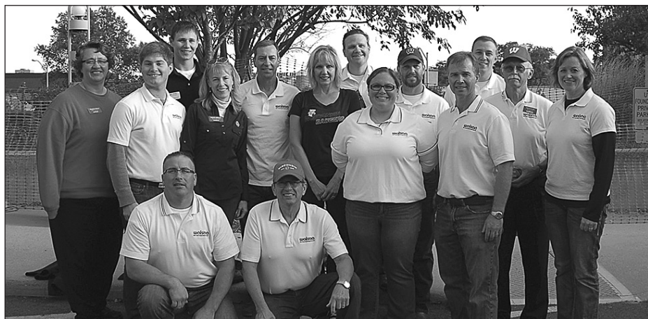
The 2015-16 WALSAA Board of Directors

In the coming months, WALSAA will be reaching out to ask for your help, both financially and with your time. During the past year, a number of volunteer