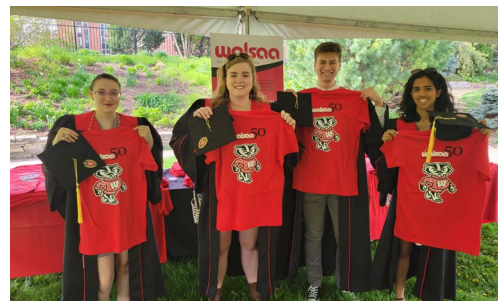
CALS grads with new WALSAA 50 th shirts

walsaa 50 Creating Connections for 50 Years