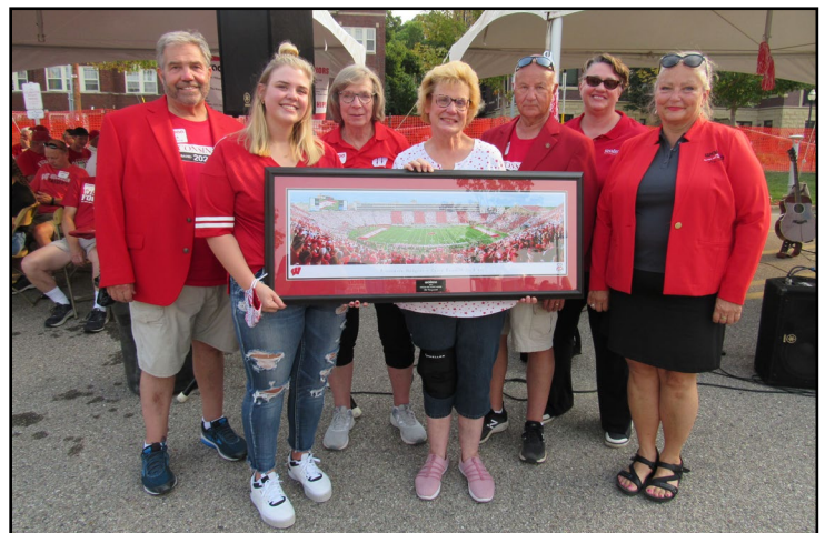
Red Jacket Award Recipients at 2021 Fire-Up

Tickets can be ordered at www.WALSAA.org . Registrations in advance of the event are appreciated, however walk-ins are also welcome. All tickets are held at the event registration desk and picked up upon arrival at Fire-Up.